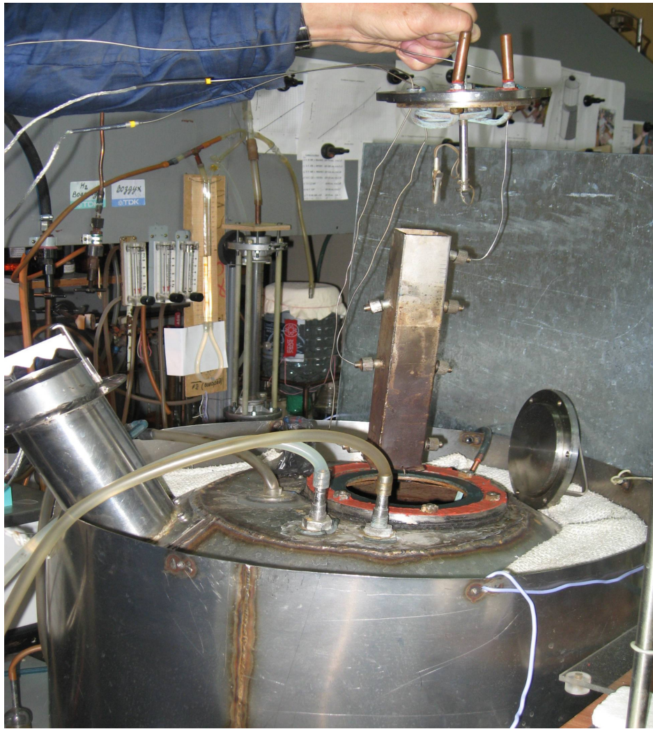
Fig.2. View of the climatic chamber at the moment of insertion of the recombiner.

When the concentration of hydrogen exceeds 15 % v/v, uneven distribution of the initial burning of hydrogen in the enclosed space of the CC, with all the objects inside it, can transform the deflagration regime into detonation, accompanied by a blast wave at a temperature more than 1000°C [3]. Nevertheless, our long-term experience in such experiments proved that, if the volume of the CC does not exceed 100 l and the concentration of hydrogen is kept below 20 % v/v, the release of the blast wave does not present significant danger provided that the following protective measures are implemented: